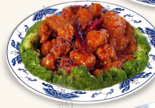
General Tso's Chicken )