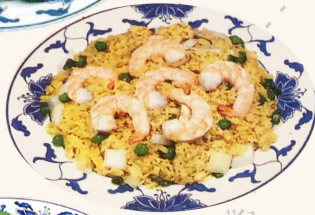
Shrimp Fried Rice