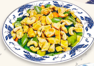
Chicken w. Cashew Nuts