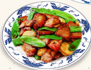
Roast Pork w. Snow Peas