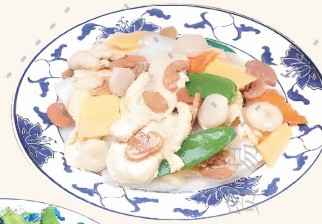
Moo Goo Gai Pan

We can alter the spice according to your taste.