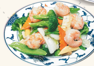
Shrimp w. Mixed Veg